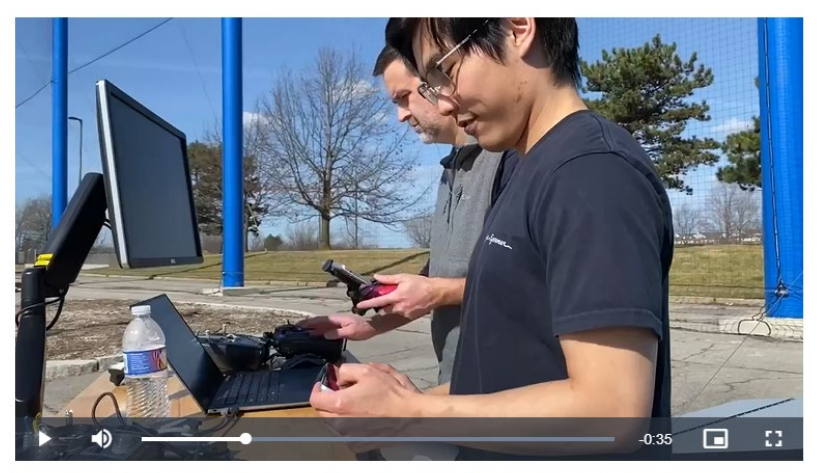
The University at Buffalo S.O.A.R. facility allows students and faculty to test out new drone technologies.

It looks like fun, but it's also part of serious research on how artificial intelligence can equip fleets of drones to launch from the roof of a delivery vehicle and fly packages to customers who live farther from a distribution center than drones can fly.