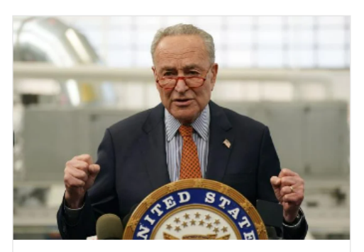
Schumer seeks to include UB, New York in federal AI research pilot

But UB has high hopes that Western and Central New York's designation as a federal tech hub will create a similar symbiosis here. The tech hub groups Buffalo, Rochester and Syracuse as one of 31 regions eligible for $54 million in federal funding to advance industries of the future. Only five to 10 of the regions will get any funding.